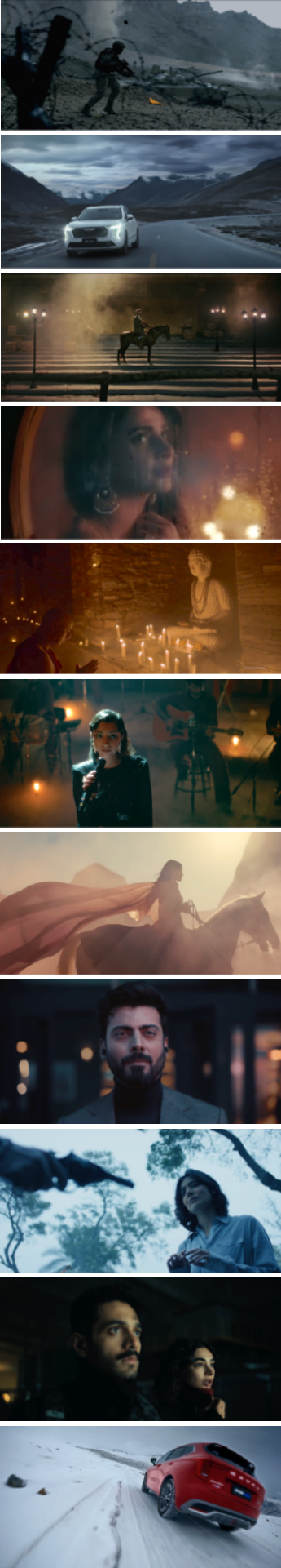
Imagery from assorted projects